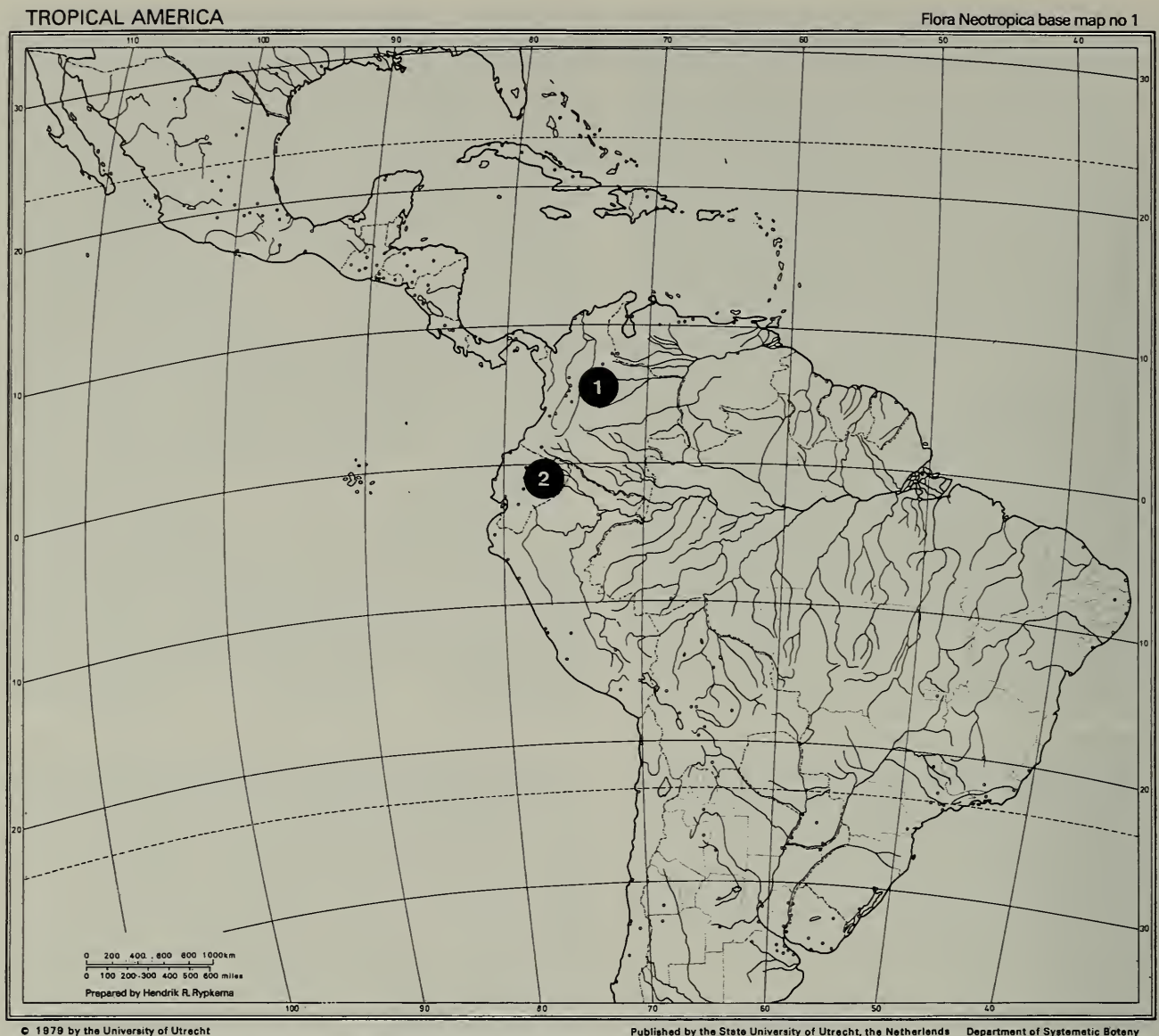
Fig. 5. Map showing distribution of A. sketi . 1, Colombian localities near La Paz and San Gil, Santander Department; 2, Ecuador locality near Archidona, Napo Province.

through short terminal papilla. Proximal course of vas deferens not discernable.